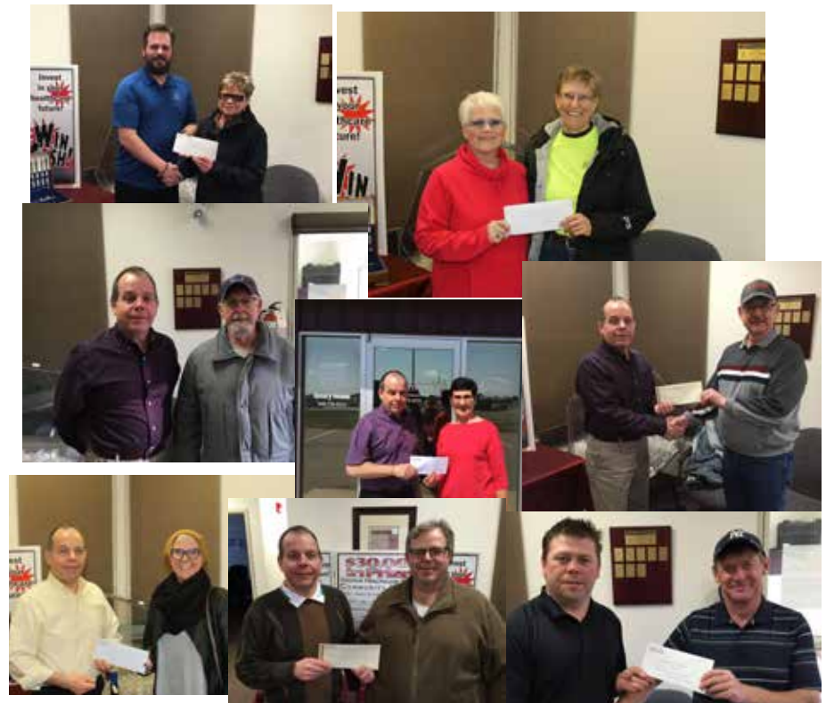
Some of our Keeping Healthcare Strong lottery winners!

We would like to thank everyone who purchased a ticket in our community lottery for 2015.