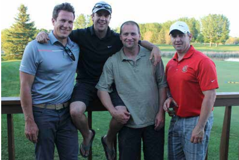
2015 Winning team

Please keep our tournament in mind if you want to come out for a fun day of golf for a great cause! It is always held on the first Friday in June! To register or to sponsor call 306-778-3314!