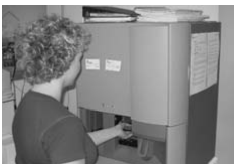
Hematology Analyzer - Eastend Wolf Willow Center & Leader Hospital