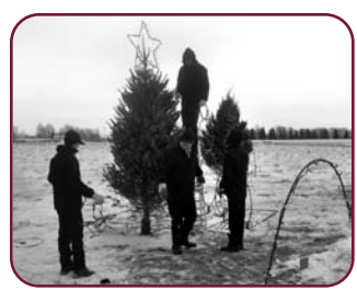
Volunteers decorating the trees for Lights for Life

This was our 1st annual Lights for Life. People, business and organizations throughout the Southwest all chipped in to make it a great success. Many of the donations were made on behalf of friends, family or people that have passed away. Donations were also made to honour or recognize others. We would like to thank all of the people that supported this project especially: