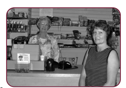
The Gift Shop up and running with the help of our volunteers

More volunteers are always needed, so if you want to have some fun and feel as though your time is well spent please let us know. We have many projects coming up in the near future as well as on going operations that continually need the help of willing individuals. The Foundation needs your help to continue delivering services to the people of the Southwest. Support and training will be provided. If you wish to learn new skills, meet people, enhance your résumé and can commit to being a volunteer call us today at (306) 778-3314 or toll free at 1-866-666-6123.