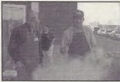
Swift Current Rotary members cook up a storm at the Annual Lobster Feed.

LOBSTER FEED presented by the Rotary Club of Swift Current was even more successful in its second year than it was in year one.