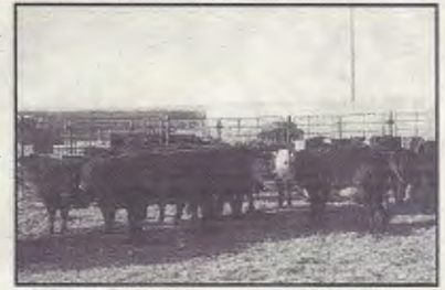
Beef Up heifers, class of 2001, at their winter home in Hazenmore.

OPEN HOUSE was hosted by the Foundation at the Swift Current Regional Hospital in the spring. It provided an opportunity for those interested to see what supporting the Foundation had done for the hospital. The new donor boards were unveiled and tours given so attendees could see in action all the equipment that had been purchased. Board members were available to answer questions and talk with the public over refreshments.