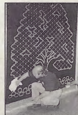
Installation of new wall completed in late fall.

The wall is not only esthetically pleasing but will help provide the funds needed to meet the equipment needs of long term care, while providing donors an opportunity to create a lasting memory or tribute.