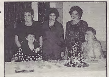
Festival of Trees Gala Volunteers get ready to go "on duty."

We also owe our appreciation to the media in the Southwest for covering the Foundation's projects and programs and for helping to keep you informed of our activities and progress as we, step by step, move