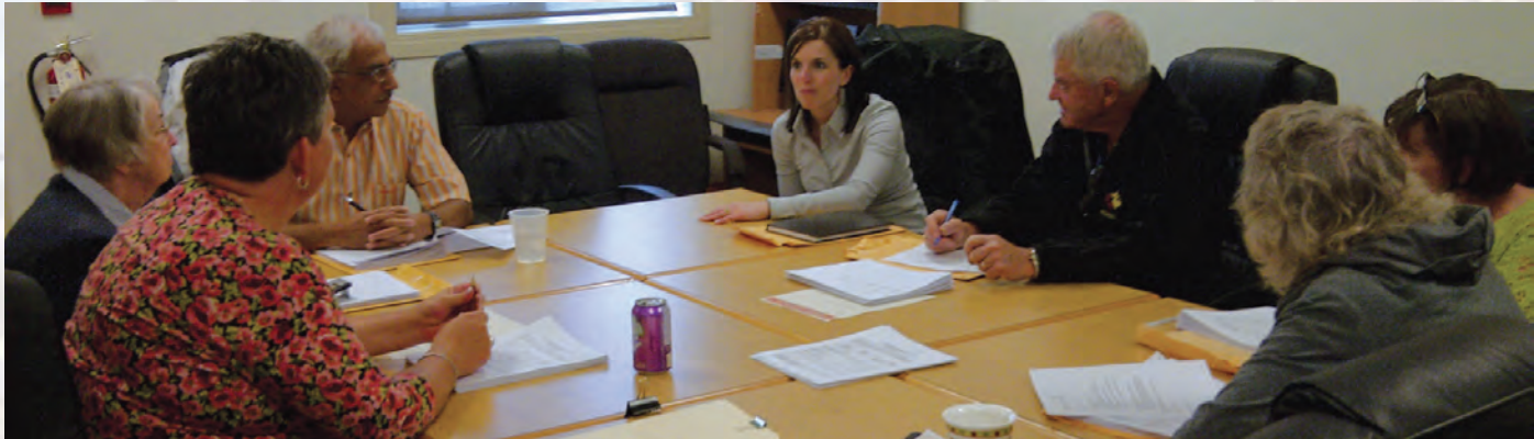
The Foundation Scholarship Committee reviewed applications from 28 Applicants for Session 20 of the Skills Enrichment Scholarship Program – 22 received “positive” consideration.

(Recipients announced as at May 31, 2012)